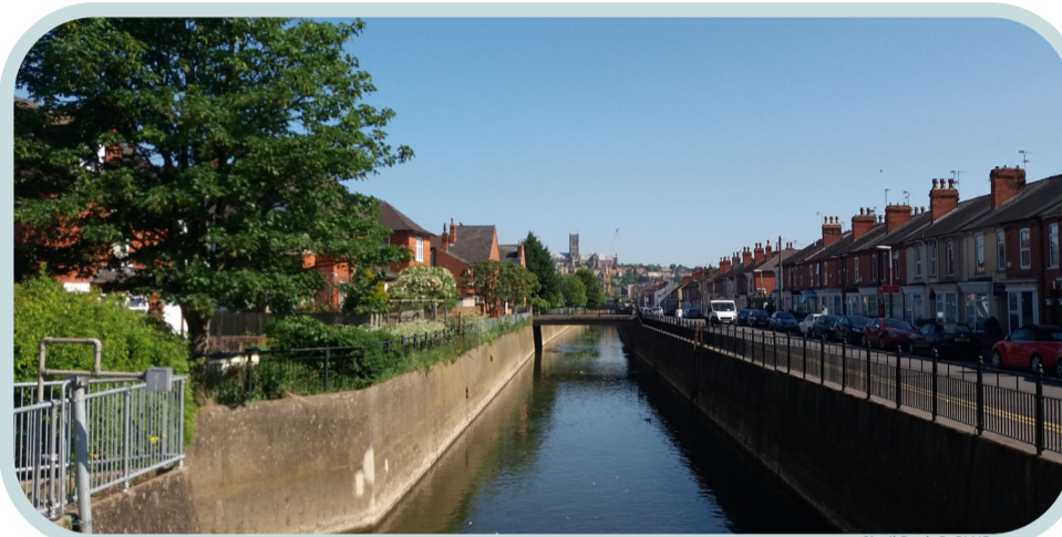
Sinclair Bank @ GLNP